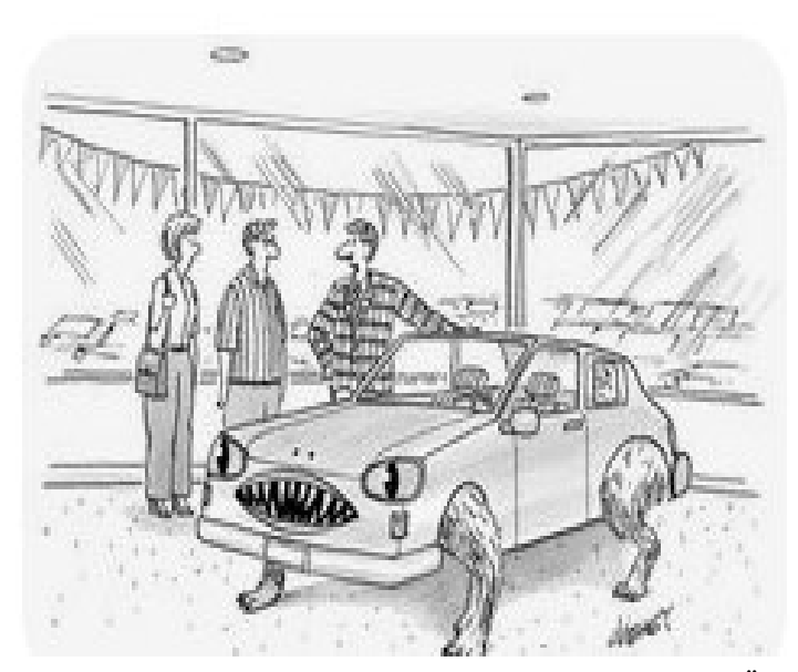
"I warned you not to take the car out during a full moon"

Commemorative Pavers are still available.